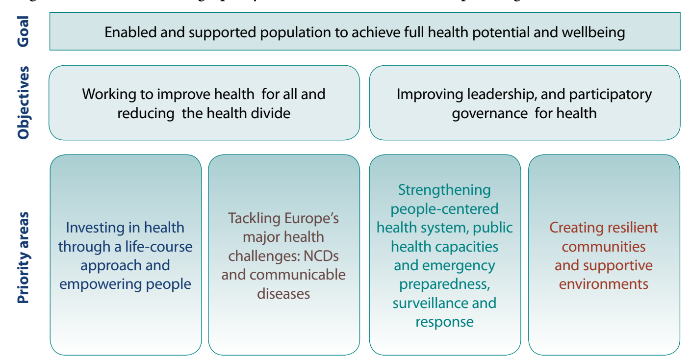
Figure 1. Health 2020 strategic policy framework for the WHO European Region

Health 2020 highlights nurses and midwives as having key and increasingly important roles to play in society's efforts to tackle the public health challenges of our time, ensure the continuity of care and address peoples' rights and changing health needs. Nurses and midwives together form the largest health professional group in all countries. As front line health care workers, they should be competent in the principles and practice of public health, so that they can use every opportunity to influence social determinants of health, health outcomes and policies necessary to achieve change. With increasing service demands and an ageing population, nurses and midwives are essential to provide safe, high quality and efficient health services across the life-course. Nurses and midwives are therefore a vital resource towards achieving the goals of Health 2020.